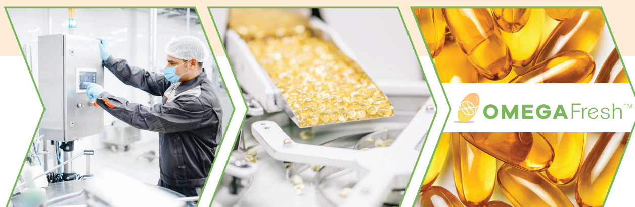
Fish Oil Concentrate

From concentrate production to encapsulation in adjoining facilities, Omega Fresh offers unparalleled freshness in premium quality fish oil.